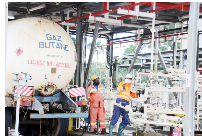
SNH's domestic gas depot: a contribution of more than 21 988 metric tons to local supply