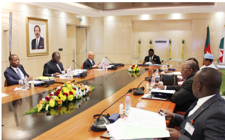
The second session of the year was held on 8 th December at SNH