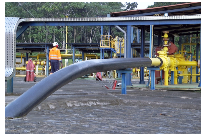
About 9 652 million cubic feet of natural gas were delivered to the Kribi power plant, corresponding to a used capacity of 149 MW